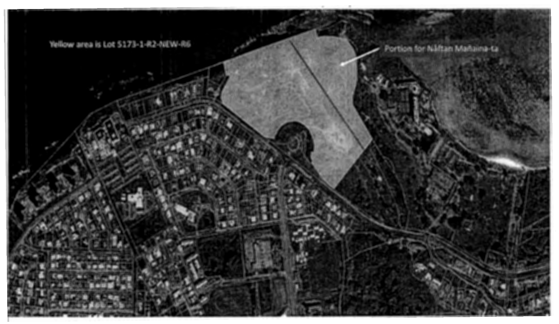
Exhibit C of Bill No. 374-33 (COR)